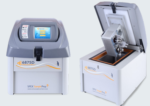
6875D Freezer/Mill® Dual-Chamber Cryogenic Grinder