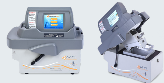
6775 Freezer/Mill® Cryogenic Grinder