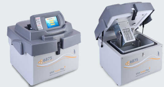
6875 Freezer/Mill® High-Capacity Cryogenic Grinder